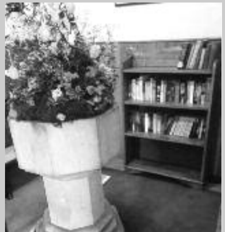
Church bookshelf up and running