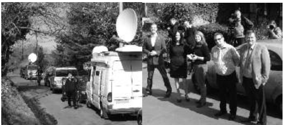
Paparazzi invasion of Mapledurwell, 9th April 2014.

The New London Sinfonia join us to play Bach's Brandenburg Concerto No 2. This promises to be a wonderful evening of Baroque music in the beautiful setting of Douai. Strawberries & cream and a glass of wine will be served before the concert, in the grounds of the Abbey. Tickets from the The Corn Exchange on 0845 5218 218 or on www.cornexchangenew.com .